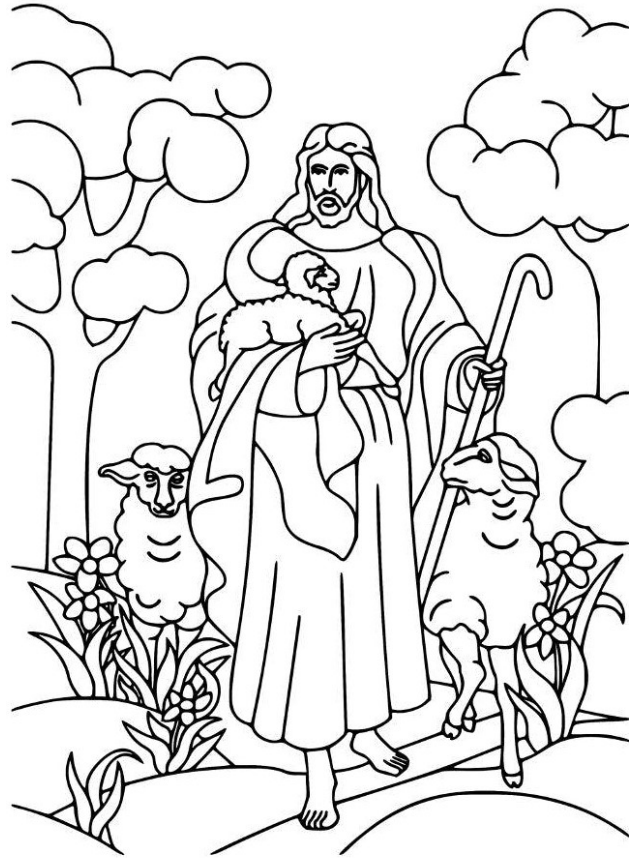
Behold, the Lamb of God, who takes away the sin of the world! - John 1:29